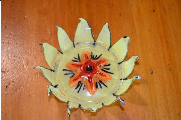
Figure 9: Variation – detailed painting and marker pen