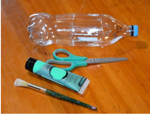
Figure 1: Bottle, paint and brush, scissors.