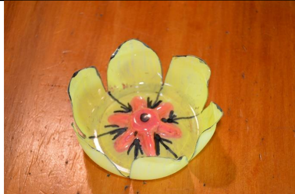
Figure 10: Variation: larger petals