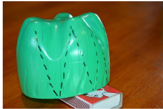
Figure 4: Preparing to cut pieces out of bottom