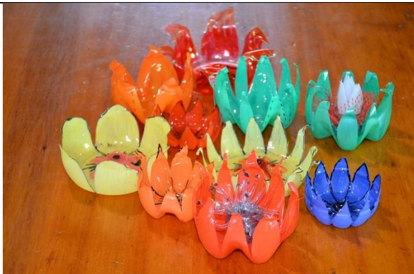
Figure 12: Collection