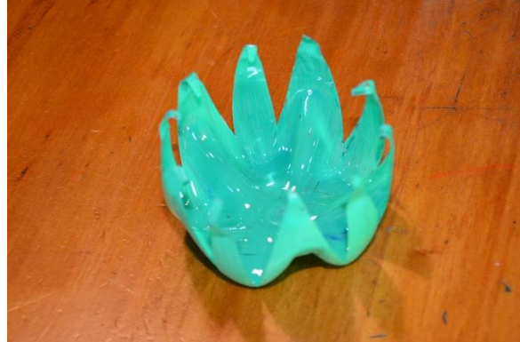
Figure 8: Variation – tips curled (see curling instructions)