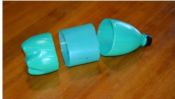
Figure 2: Paint bottle, and then cut into three pieces. Keep the bottom of the bottle and put the other pieces aside for another project.