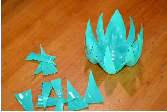
Figure 7: Flower shape, discard offcuts