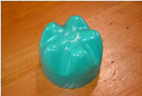
Figure 3: Bottle bottom