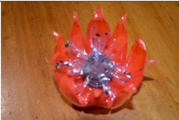
Figure 11: Variation: added stamens in bottle top