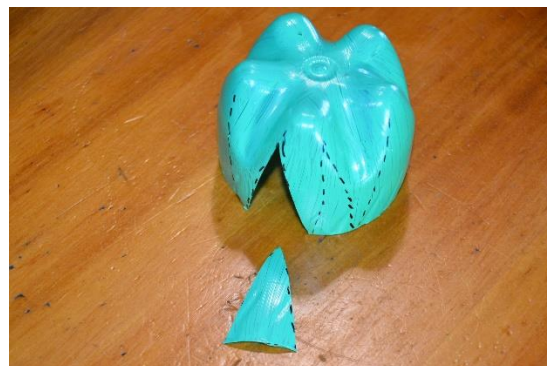
Figure 6: Do the same for other sections.